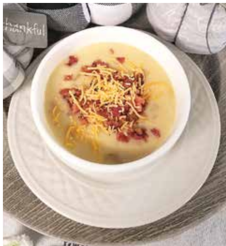
Soup season has begun.

If you are looking for a place with homestyle food and small-town hospitality, you can't do better than the Café on the Hill. Even if it's your first visit, you'll be welcomed warmly — and you won't leave hungry. ■