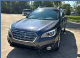
2017 Subaru Outback Premium 132,153 miles #391357 $13,900