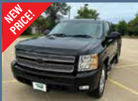
2013 Chevrolet Silverado 1500 LTZ 138,377 miles # 232337 $19,000