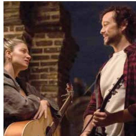
"Flora and Son"