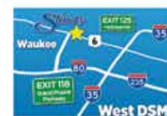
ON THE WAUKEE SIDE OF WEST DES MOINES

Iowa's #1 Ford LINCOLN Dealer* Stivers Ford LINCOLN WAUKEE NEW STIVERS MIDWEST PRO UPFITTERS STIVERSFORDIA.COM 1.800.747.2744