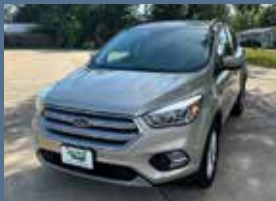
2018 Ford Escape SEL 111,465 miles #A75686 $13,900