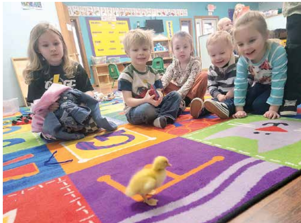
SPECIAL TO GUTHRIE CENTER TIMES

Even though construction of the new building is ongoing, the Little Charger Early Learning Center continues to fundraise to cover the cost of the building. A variety of grants, fundraisers and donations have helped get the ball rolling, but more is needed to cross the goal line. As part of that effort, a fundraiser event is scheduled Oct. 28. The event includes a catered meal by Café on the Hill, wine and beer by Twin Vines Winery, silent and live auctions, and dueling pianos music.