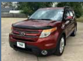
2014 Ford Explorer LTD 107,477 miles #A01129 $16,500