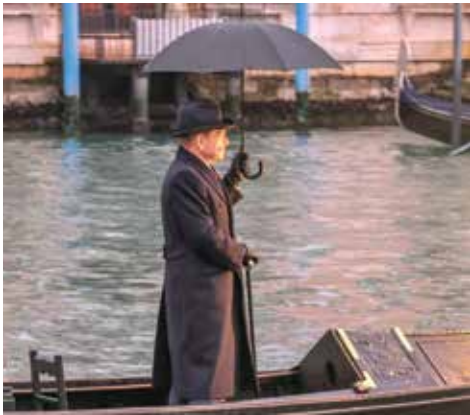
"A Haunting in Venice"

This is an animated movie targeting kids about Leonardo DaVinci. I am not sure if the kids are going to choose this over the "Paw Patrol" movie (actually, I am sure that the pups would easily win that race), but it was well done, and maybe the older kids will appreciate it more.