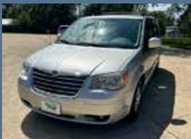
2009 Chrysler Town & Country Touring 109,443 miles #626233 $7,900