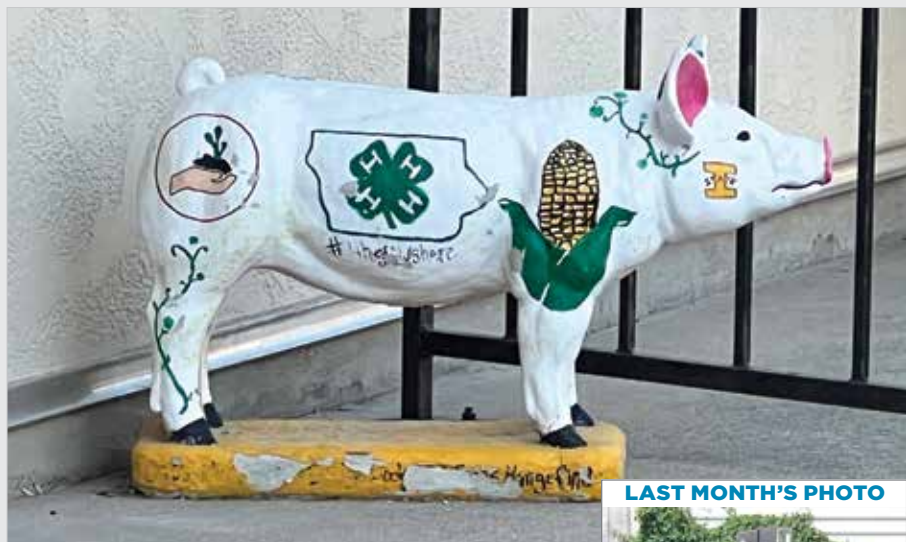
LAST MONTH'S PHOTO