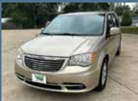
2014 Chrysler Town & Country Touring 104,922 miles #192385 $10,900