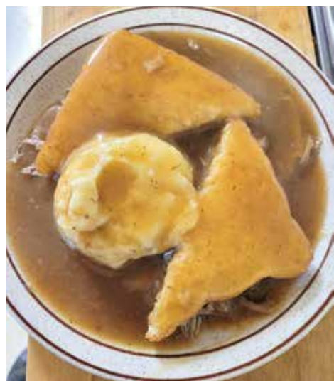
The hot beef plate is a popular menu item.

One of Sarah's favorite things about running the Café is that it has become more than just a place to eat. In Guthrie Center, the Café is one of the main meeting spots,