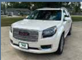
2014 GMC Acadia Denali 133,777 miles # 223139 $14,900