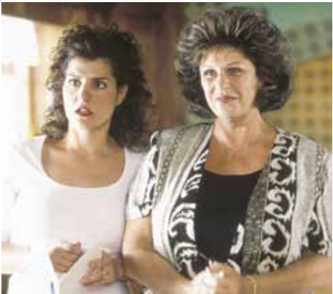
"My Big Fat Greek Wedding 3"

I am not a fan of these Agatha Christie movies. I always feel manipulated, and I honestly think that any one of these people could be the culprit. That being said, this one held my interest, though I really didn't care who committed the crime. Kenneth Branagh again plays the retired Hercule Poirot pulled back into the game. Tina Fey is also a nice addition to the cast.