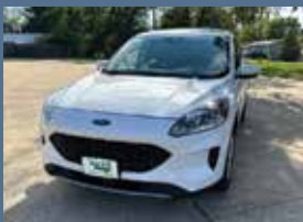
2020 Ford Escape SE 113,421 miles #B25751 $15,900