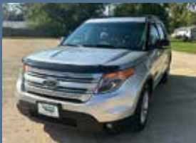
2012 Ford Explorer XLT 115,066 miles #A77509 $13,900